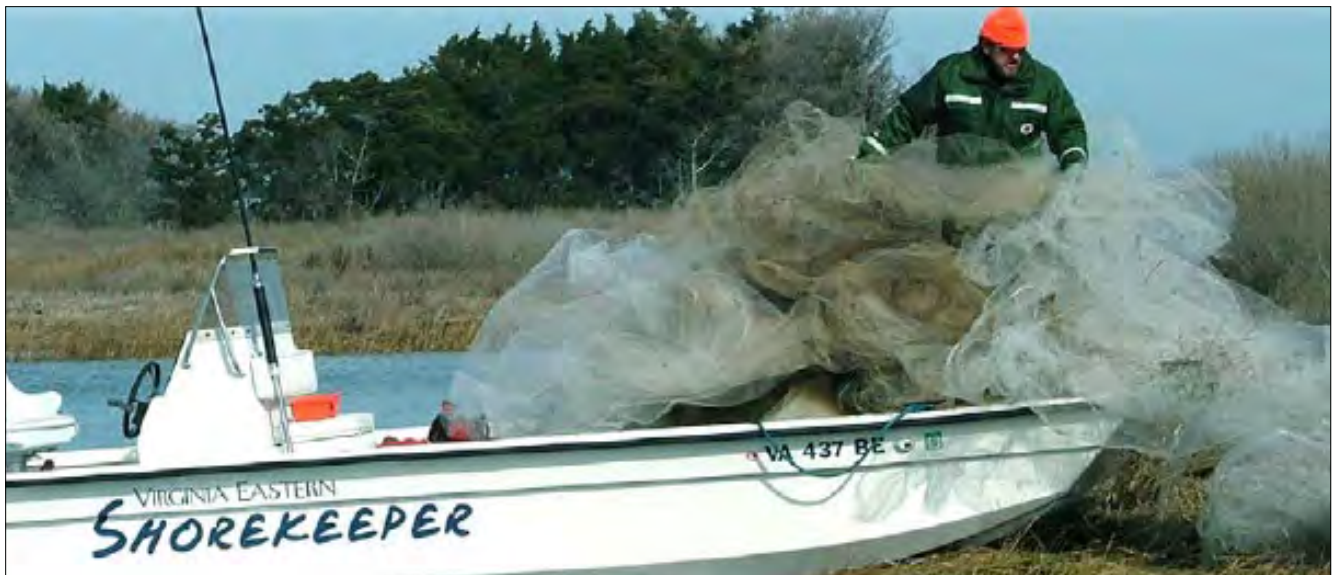
The Virginia Eastern Shorekeeper removes a large clam net from the Mockhorn Island Wildlife Management Area.

The Virginia Coastal Zone Management (CZM) Program began working on marine debris issues in 2012. This presentation will provide a brief overview of events and efforts that the program has undertaken since 2012 and a preview of plans for the next five years that include work both in the state and in the Mid-Atlantic region. Efforts to date include the 2013 Marine Debris Summit in VA Beach; establishment of and several meetings of a VA Marine Debris Leadership Team; development of the Virginia Marine Debris Reduction Plan; establishment of shoreline monitoring using contractors and volunteers at 4 locations in Virginia (Fisherman Island NWR, Chincoteague NWR, Back Bay NWR and Grandview Nature Preserve in Hampton) following NOAA's national protocols; submittal of the resulting data to the national database; creation of a social marketing campaign to reduce balloon releases that employs focus groups to better understand barriers to desired behavior changes and craft effective messages; and this 2nd Marine Debris Summit. Future planned work includes continuation of the balloon campaign; continuation of the shoreline monitoring; and efforts to work with NOAA, the Mid-Atlantic Regional Council on the Ocean (MARCO) and the Mid-Atlantic Regional Planning Body to develop a Mid-Atlantic marine debris reduction plan that can build upon Virginia's efforts. The Mid-Atlantic RPB is proposing to include work on marine debris reduction in its Ocean Action Plan to be released in June 2016.