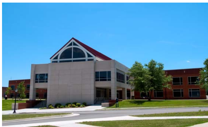
The Janet D. Greenwood Library

The Greenwood Library provides informational resources that enhance learning within formal and informal learning and teaching spaces. We also extend our resources to public school teachers and administrators.