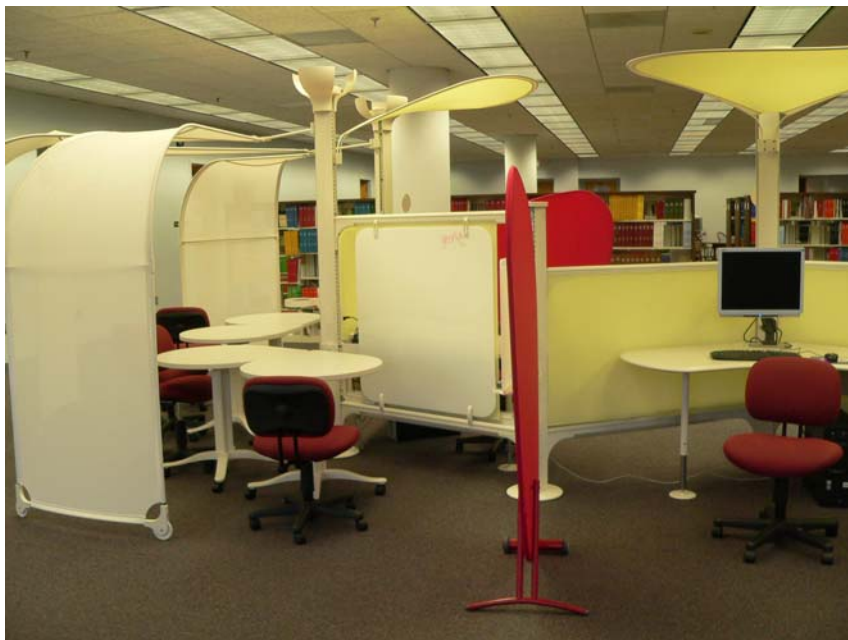
Some of the changes in the Information Center include new furniture from Herman Miller.

The Greenwood Library’s Information Center has the design and service features that support learning, including a variety of learning spaces, knowledgeable staff and peer student assistance, a coffee shop in the library, classrooms, and the presence of writing and tutoring services. This recent project reflects our efforts to provide a centrally located, common intellectual space for students and faculty to interact and have full-service access to technology and expert research assistance.