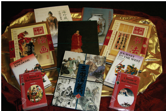
Books from Greenwood Library's Anhui University Collection

The collection from Anhui University is housed in Greenwood Library's Special Collections Room which is open to the public.