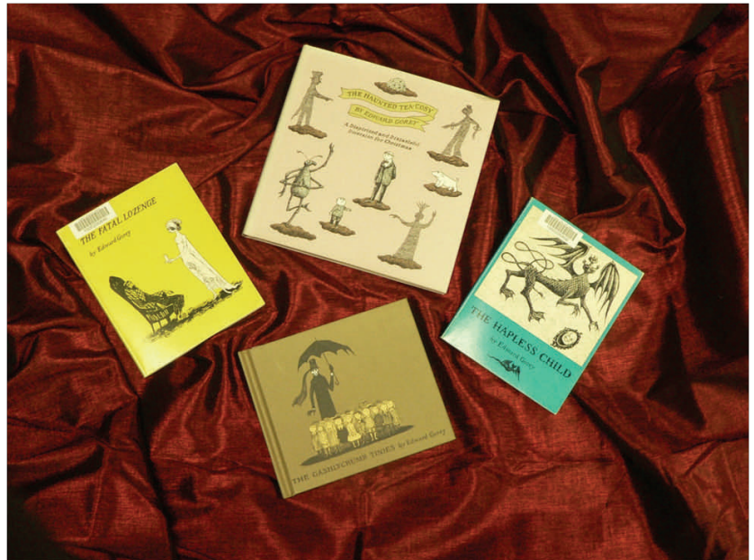
Some of Edward Gorey's books from the Greenwood Library collection