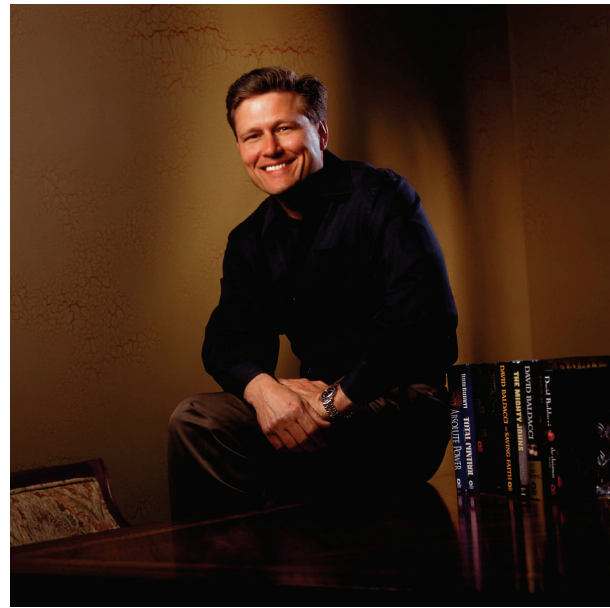
David Baldacci will appear at Greenwood Library on April 3, 2009.

The evening with Mr. Baldacci will begin with a reception at 6 p.m. in the Library atrium. Baldacci will speak in Molnar Recital Hall in Wygal at 7 p.m. Following this talk, there will be a book signing in